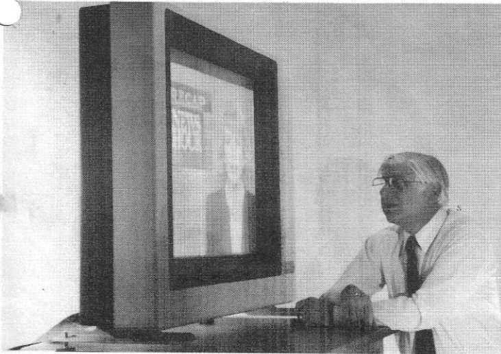
Off the air TV; wide viewing angle