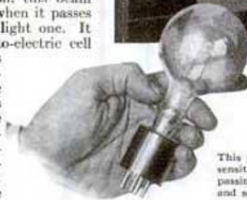
This photo-electric cell is so sensitive that it will note the passing of the faintest cloud and set in operation a needle to record it on a weather chart.

an accuracy of a hundredth of a second as against a tenth of a second—the best attainable with a stop watch. Even greater accuracy is possible, for Drs. E. O. Lawrence and J. W. Beams have proved in the Yale University laboratories that the electrons respond three billionths of a second after the light ray strikes the cell.