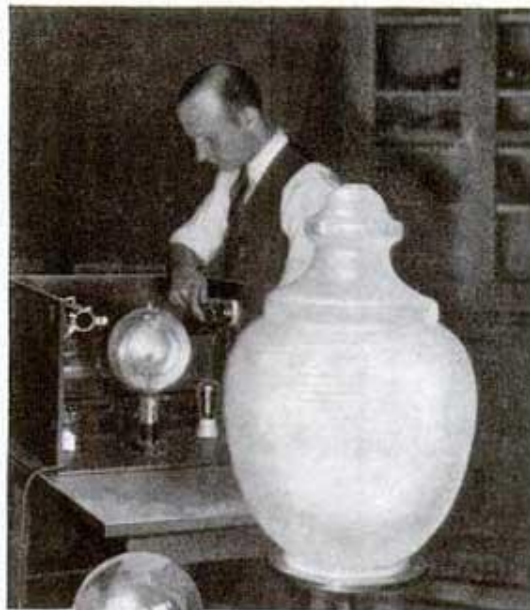
A photo-electric cell apparatus for measuring the light-transmitting properties of ornamental glass globes for street lamps—in use by General Electric Company.